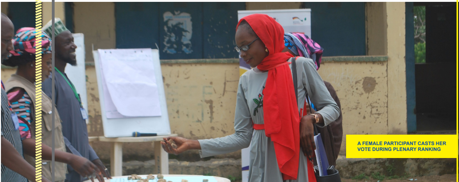
A FEMALE PARTICIPANT CASTS HER VOTE DURING PLENARY RANKING