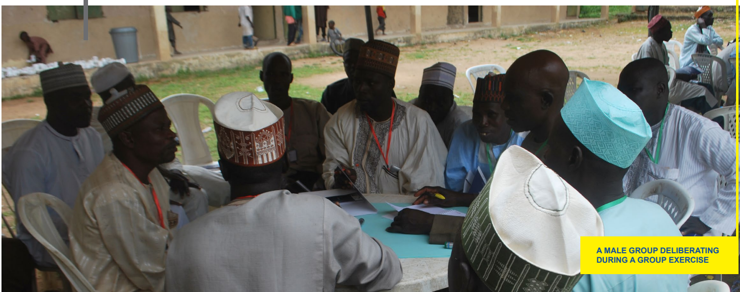
A MALE GROUP DELIBERATING DURING A GROUP EXERCISE