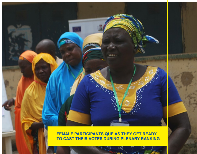
FEMALE PARTICIPANTS QUE AS THEY GET READY TO CAST THEIR VOTES DURING PLENARY RANKING