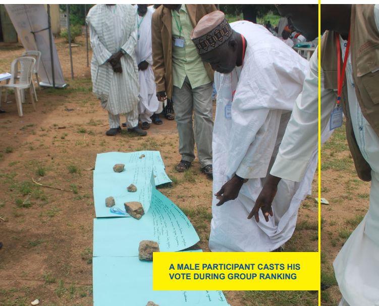
A MALE PARTICIPANT CASTS HIS VOTE DURING GROUP RANKING