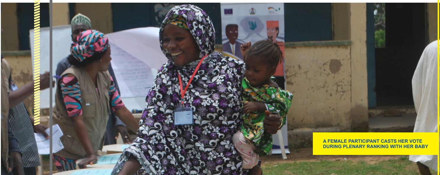
A FEMALE PARTICIPANT CASTS HER VOTE DURING PLENARY RANKING WITH HER BABY