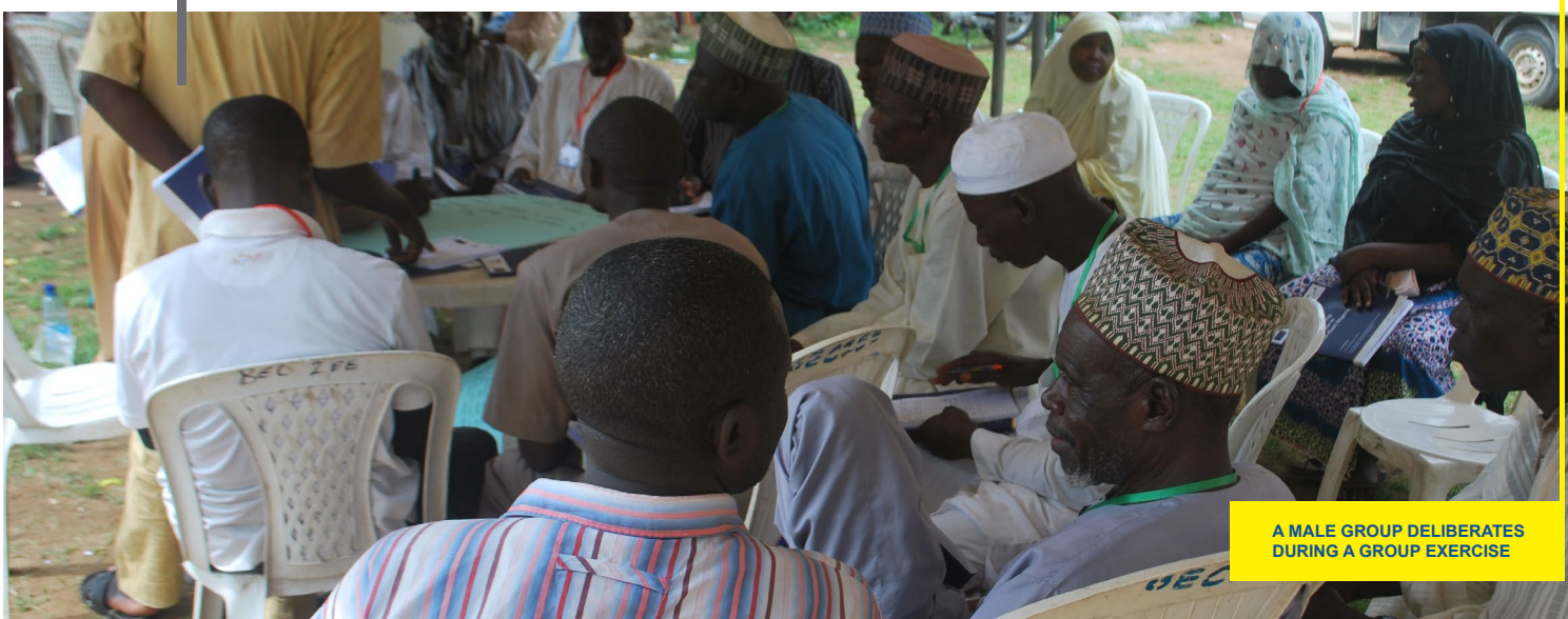
A MALE GROUP DELIBERATES DURING A GROUP EXERCISE