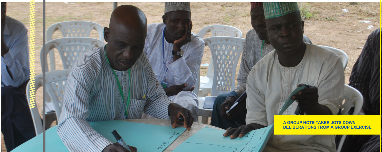
A GROUP NOTE TAKER JOTS DOWN DELIBERATIONS FROM A GROUP EXERCISE