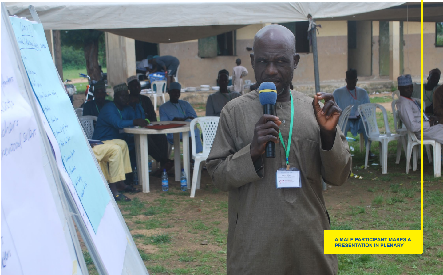
A MALE PARTICIPANT MAKES A PRESENTATION IN PLENARY

The Community Development Planning (CDP) sessions took place in Gude ward from 19 – 22nd August 2019 at Gude Primary School. The CDP sessions were facilitated to provide a platform for all community stakeholders to identify, discuss community problems and proffer solutions; to train participants for active future engagements in matters of development and to create a joint vision and ward development plan. The participants identified the following as some of the resources found in our communities: Farmlands, economic trees, large population, food and cash crops, etc. Inadequate water supply, inadequate farm inputs, poor telecommunication network services, insecurity, etc. are some of the challenges hindering the development of our ward. At the end of sessions, a follow-up committee was established and tasked with the responsibility of advocating and lobbying for projects on behalf of our communities.