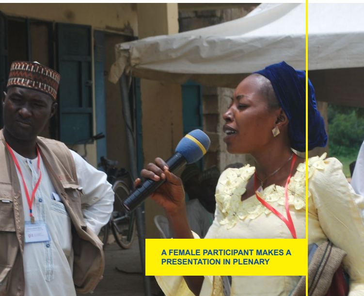
A FEMALE PARTICIPANT MAKES A PRESENTATION IN PLENARY