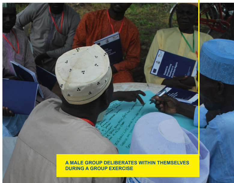
A MALE GROUP DELIBERATES WITHIN THEMSELVES DURING A GROUP EXERCISE