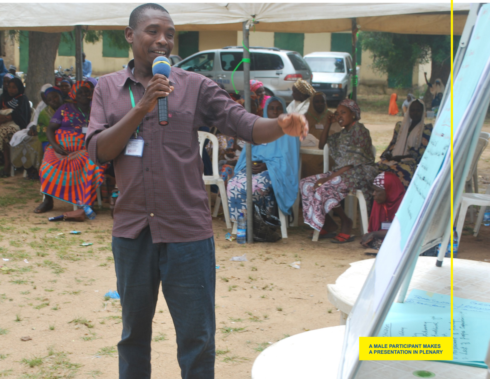
A MALE PARTICIPANT MAKES A PRESENTATION IN PLENARY