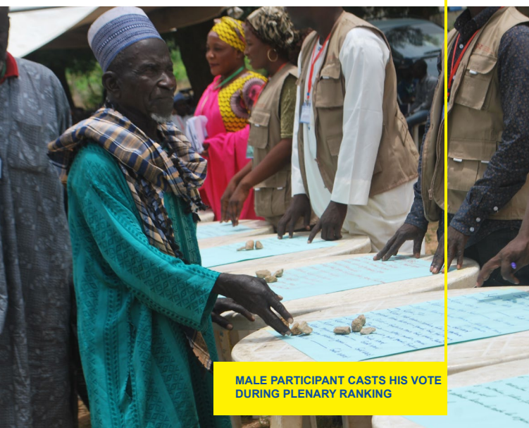
MALE PARTICIPANT CASTS HIS VOTE DURING PLENARY RANKING