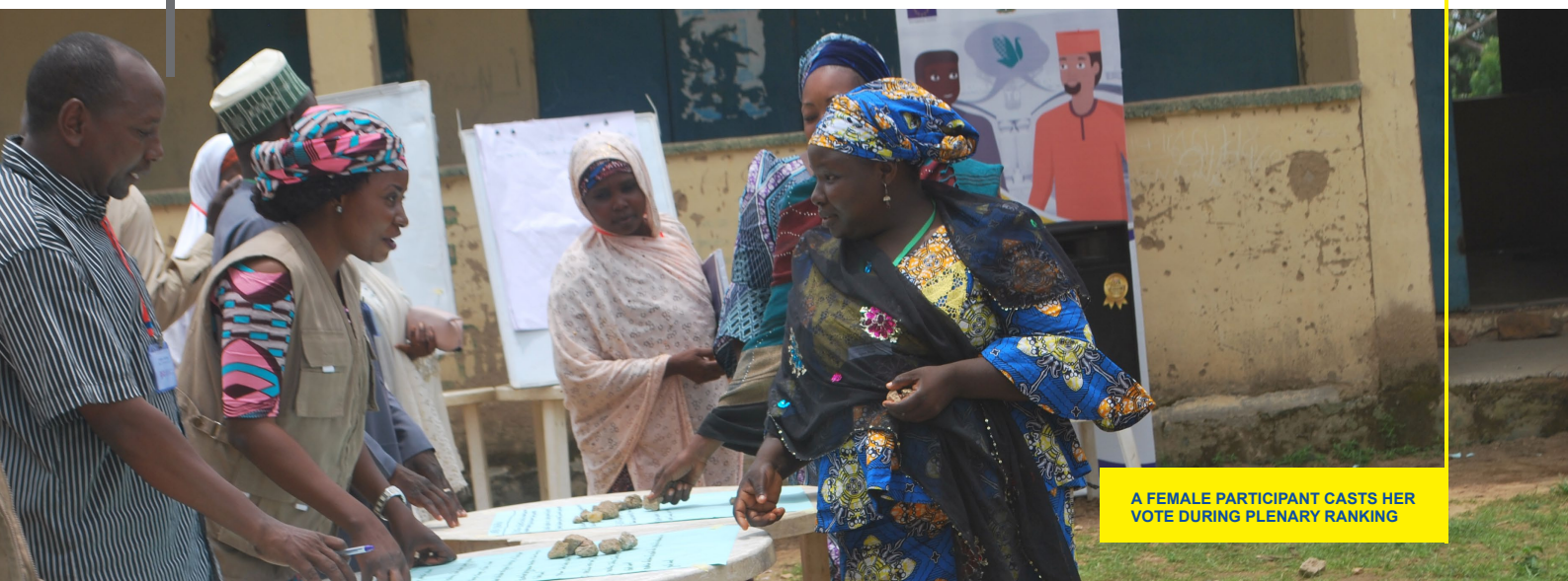
A FEMALE PARTICIPANT CASTS HER VOTE DURING PLENARY RANKING