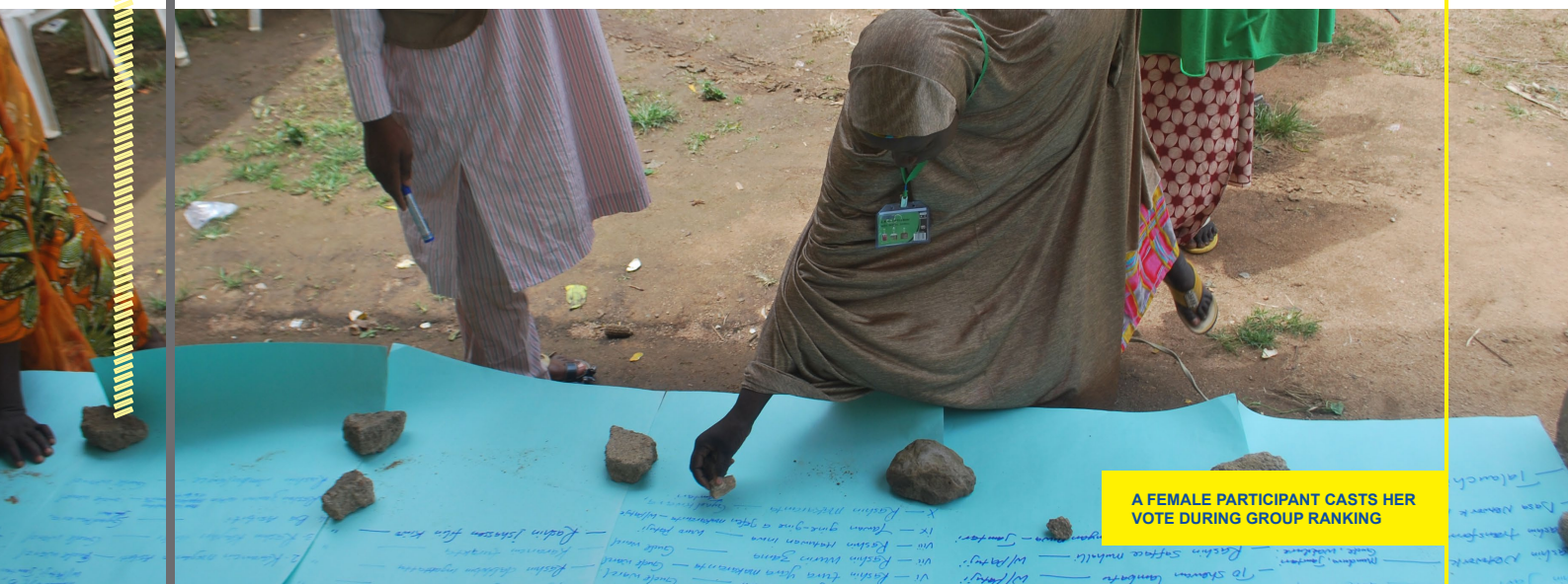
A FEMALE PARTICIPANT CASTS HER VOTE DURING GROUP RANKING