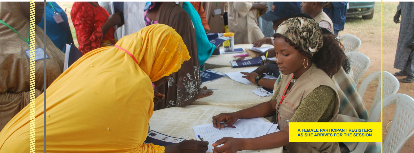
A FEMALE PARTICIPANT REGISTERS AS SHE ARRIVES FOR THE SESSION