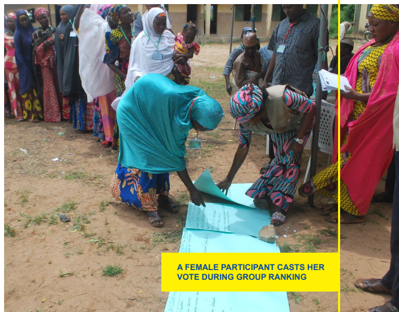
A FEMALE PARTICIPANT CASTS HER VOTE DURING GROUP RANKING

The tangible results of the Gude ward CDP process and especially the CDP session is this Ward Development Plan. The Plan and its content were validated by the representatives of the Gude Ward.